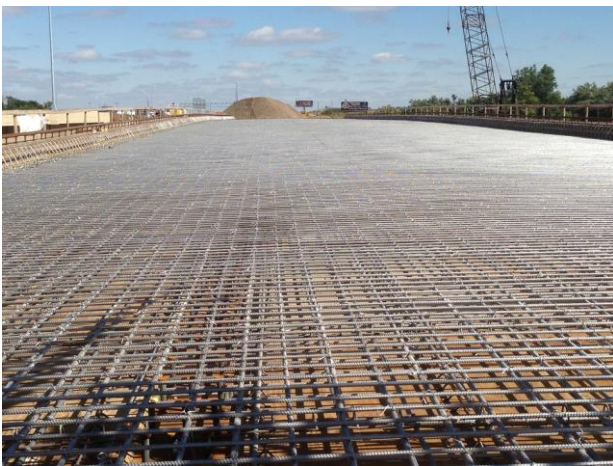
250 tons of stainless steel grade Duplex 2304