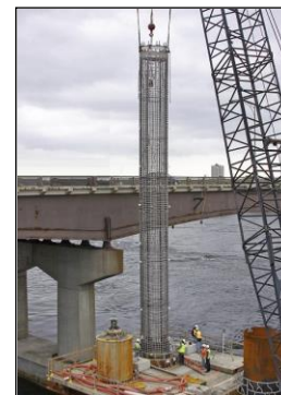
New bridge over Little Bay on the Spaulding Turnpike (NH)

Over two hundred million trips are taken daily across deficient bridges in the nation's 102 largest metropolitan regions. In total, one in nine of the nation's bridges are rated as structurally deficient, while the average age of the nation's 607,380 bridges is currently 42 years. The percentage of bridges that are either functionally obsolete or structurally deficient has been declining slowly over the last decade as states and cities increased efforts to prioritize repairs and replacements. In 2012, one in nine, or just below 11%, of the nation's bridges were classified as structurally deficient. The number of bridges defined as functionally obsolete has also declined, with currently 24.9% of the nation's bridges defined in either deficiency category. However, while billions have been spent annually on bridge construction, rehabilitation, and repair in the last twenty years, current funding levels are not enough to repair or replace the nation's large-scale, urban bridges, which carry a high percentage of the nation's traffic. To illustrate, the nation's 66,749 structurally deficient bridges make up one-third of the total bridge decking area in the country, showing that those bridges that remain classified as structurally deficient are significant in size and length, while the bridges that are being repaired are smaller in scale. (2013 Report Card for America's Infrastructure – ASCE, http://www.infrastructurereportcard.org/a/#p/bridges/overview )