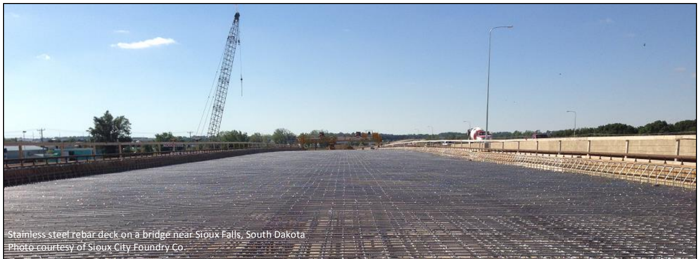
Stainless steel rebar deck on a bridge near Sioux Falls, South Dakota

maximum carbon (C) content of less than 1.20 percent. There are several stainless steel alloys used for reinforcing bars. The specific alloy used depends on the project requirements and design properties required by the LDP.