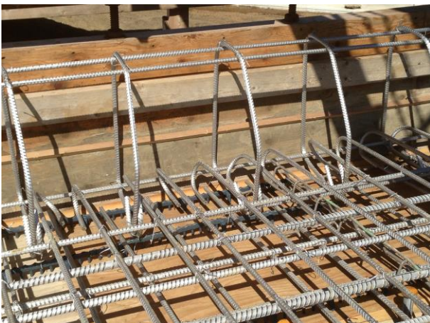
Contractor overcame challenges with tie wire and bar supports