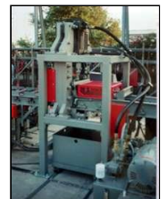
RMS 611 Hydraulic Guillotine Shear

Road includes a new RMS Shearline that can be operated conventionally, or controlled by computer software. Integrated with the Shearline is a RMS 611 Hydraulic Guillotine Shear, which is a completely automated Shearing System. The 611 Shear can substantially increase productivity while reducing shearing costs compared with conventional shears. The unique design of the 611 Shear makes it virtually impossible for an operator to place fingers or hands anywhere near the moving parts of the shear. The RMS station has double loading tables and double discharge.