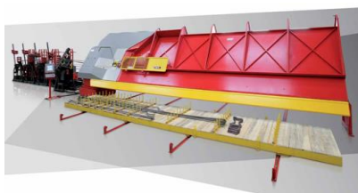
MEP Planet 20 Plus coil machine

Another feature of the facility is a new MEP Planet 20 Plus coil machine ( http://www.youtube.com/watch?v=5mLPsDVcfGs ) used for coil processing, straightening and shaping. The high productivity of the Planet 20 ( http://www.retecon.co.za/retecon/reinforcing-steel/stirrup-shape-benders-coil/mep/planet-20-plus/ ) is for serial production (same diameter with two wires up to 16 mm) and "classified" production, when processing individual building elements such as beams and columns (variable diameters with single wire up to 20 mm).