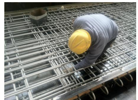
Bridge deck is comprised of a reinforced concrete slab on top of, and composite with, an unfilled steel grid.