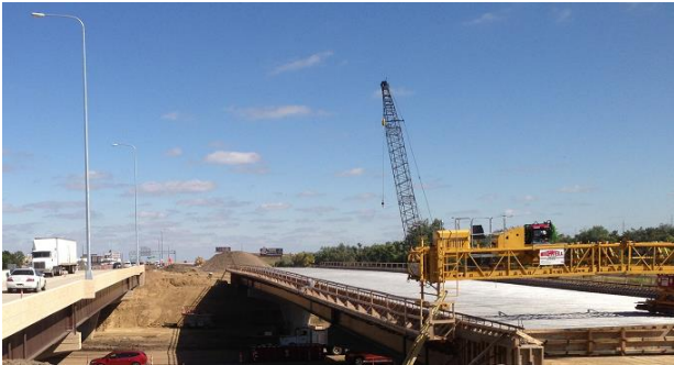
Twin bridges on Interstate 90 span SD Highway 115